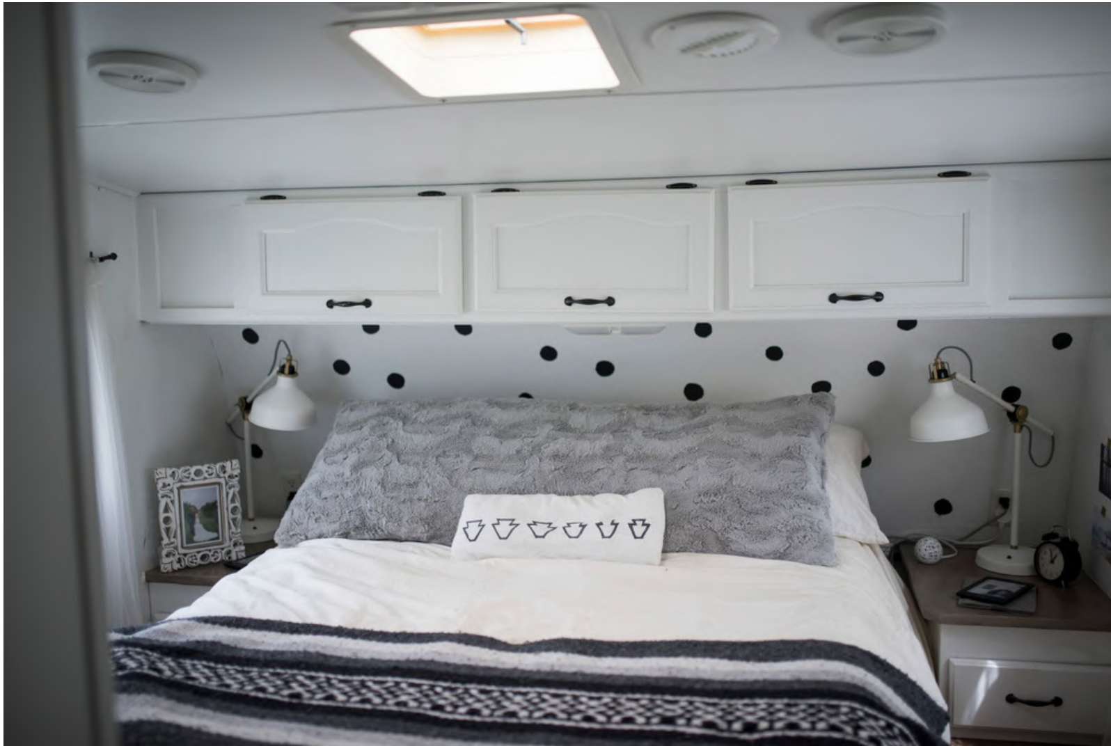
A classic white paint job in the bedroom by 188sqft.com