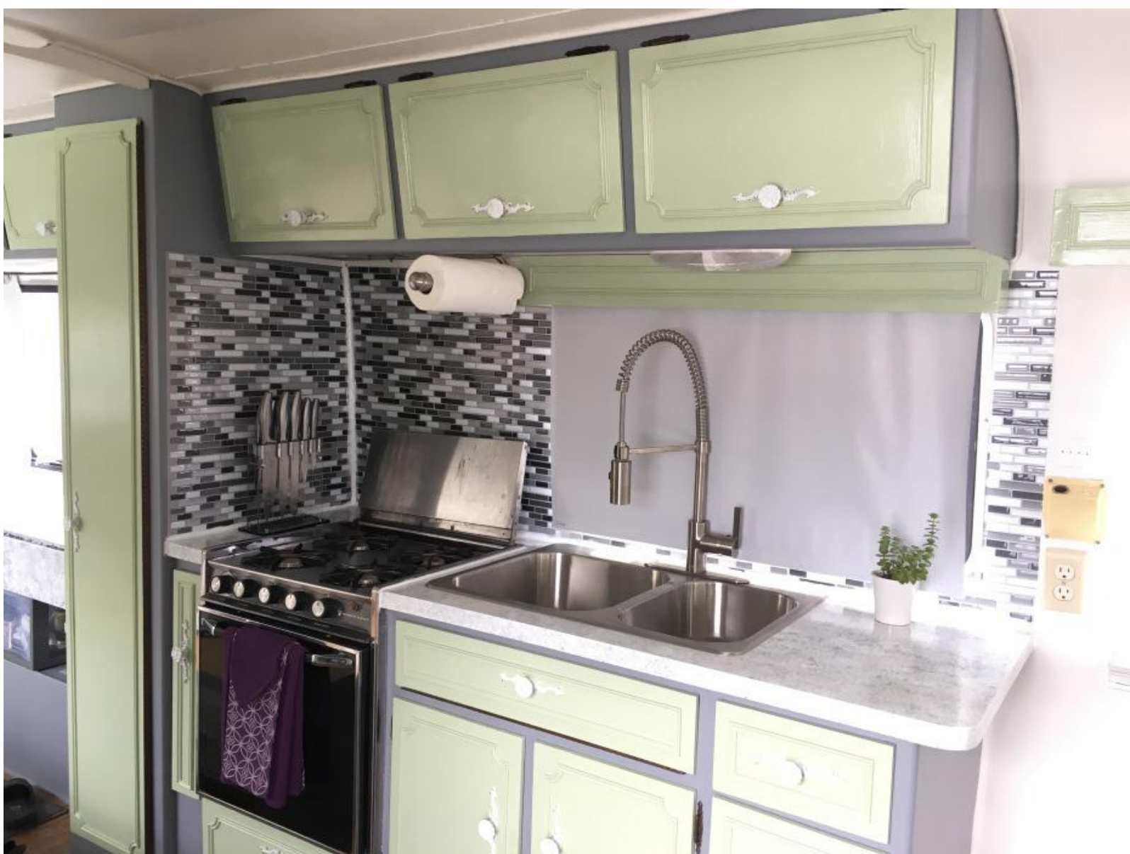
Less traditional, more funky flare by boondockorbust.com