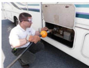
Motorhome ASME propane tank

Motorhomes, though, have installed ASME (American Society of Mechanical Engineers) tanks, not DOT tanks. ASME tanks are not required to be re-certified since they are permanently installed. But DOT/TC cylinders, both vertical and horizontal, because they can be removed, transported and filled independently, do qualify for periodic re-certification.