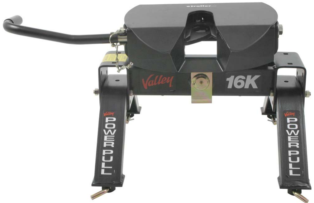
Figure 4– A poor hitch head design – note the thin jaws

A poorly designed hitch head adds to your ride discomfort and longevity of your truck and trailer.