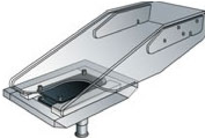
Figure 2 – Mor/ryde Rubber Shear Springs

Mor/Ryde offers a variation away from air ride in their “shear spring” design. Essentially, two rubber pads that absorb some of the bouncing and chucking of the trailer. Again, a heavy trailer will require more than the Mor/Ryde system can offer, but it is an improvement over the standard pin box system.