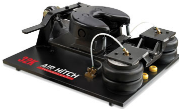
Figure 3 – Air-ride 5 th wheel hitch

The best option to the 5 th wheel problem is with an air-ride hitch, one mounted into the bed of the truck. Such a system allows for far greater air-capacity and better engineering solutions. There are several models on the market, all of which include air-ride of one type or another.