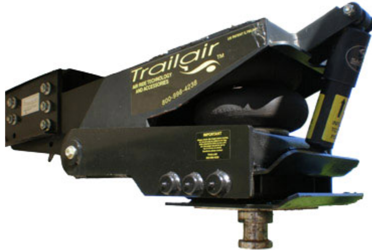
Figure 1 – Pin Box Air-Ride system

The most common solution is an air-ride system that mounts directly to the trailer pin box. Often these are included in the purchase of a 5 th wheel and, as a matter of convenience, the buyer looks no further for a suitable replacement.